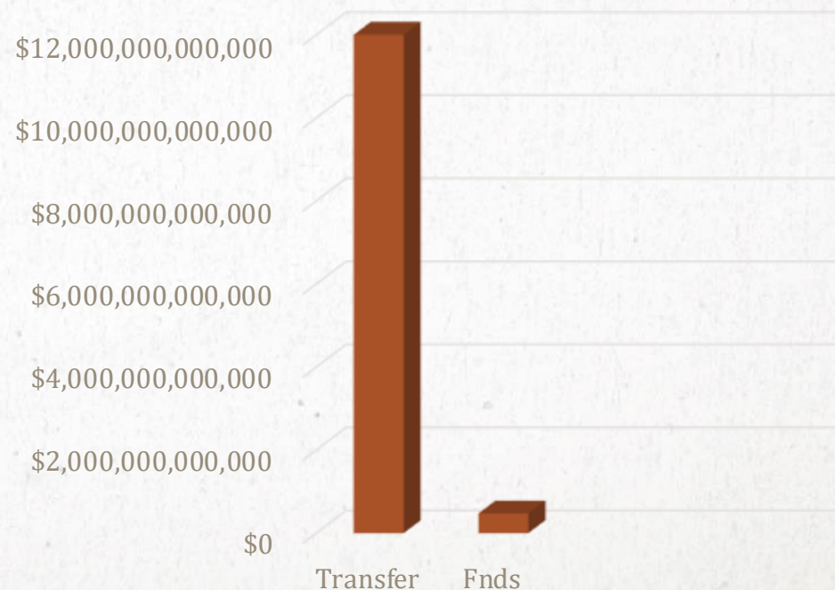
Wealth Transfer vs Foundational Giving